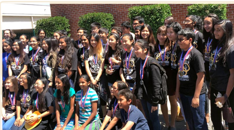
Middle School STEM Olympics, April 16, 2016 at Carmenita MS