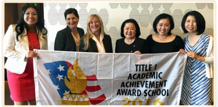
All Title I Schools received the Title I Achievement Award like Carver Academy.