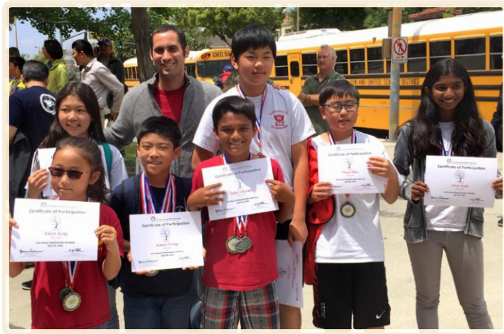
Wittmann ES Silver Medal Winners