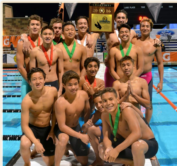
2016 California CIF Southern Section Division IV Champions. Three years in a row.