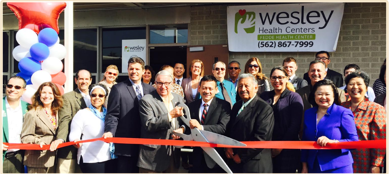
Wesley Health Center Grand Opening, April 15, 2016 at Fedde MS