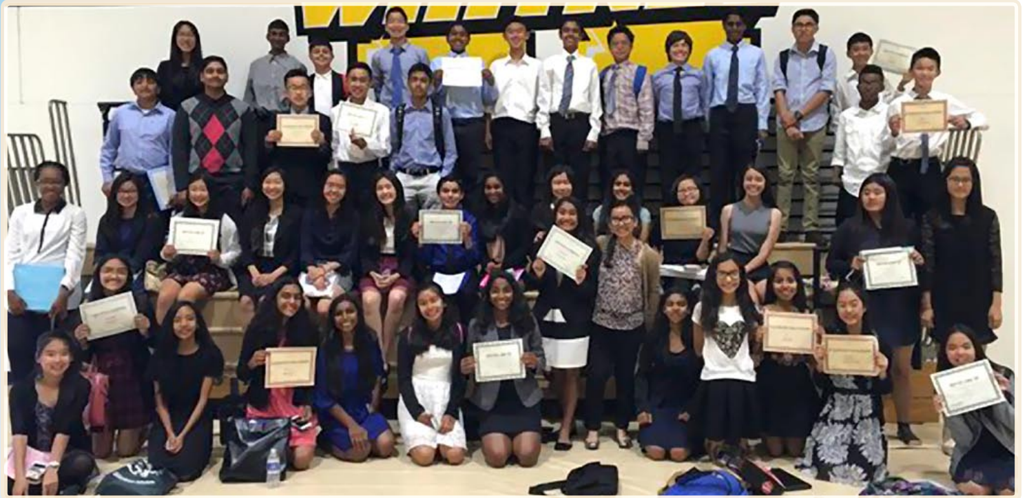
It looks like our delegates changed the world!