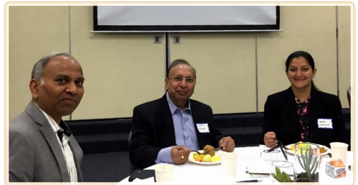
Artesia Chamber of Commerce