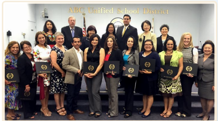
Board recognition of the Dual Language Immersion teachers