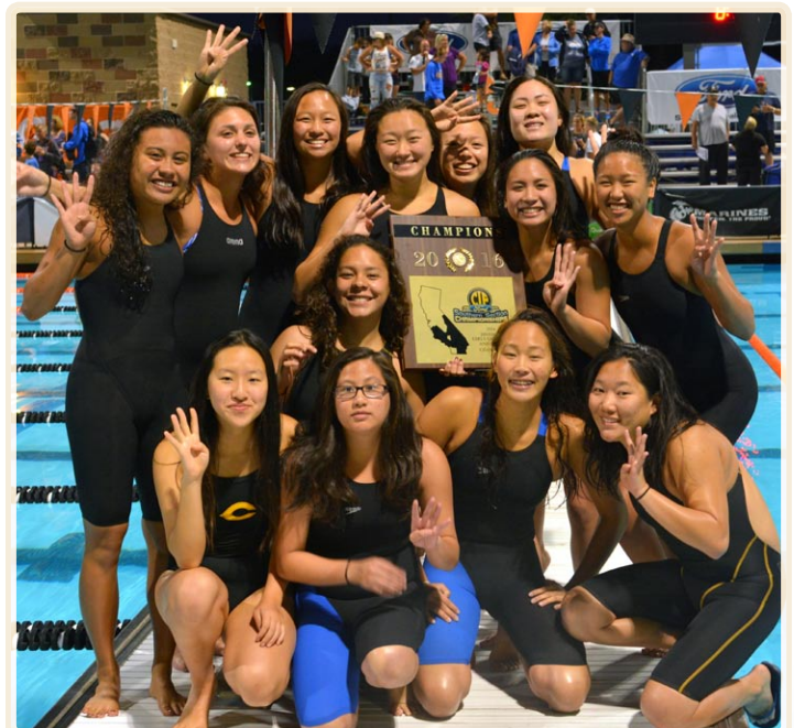
2016 California CIF Southern Section Division IV Champions. Four years in a row.