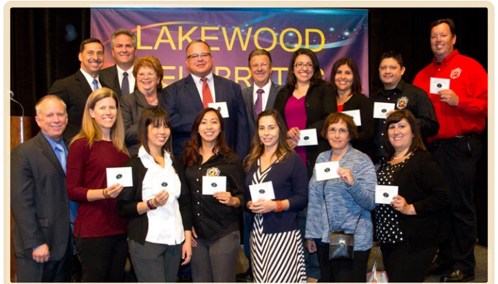
Artesia HS administrative team and teachers recognized for "Making a Difference".