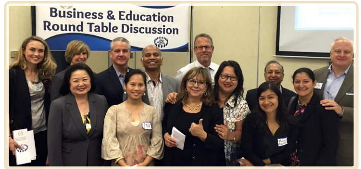
Kicking off the Business Education RoundTable