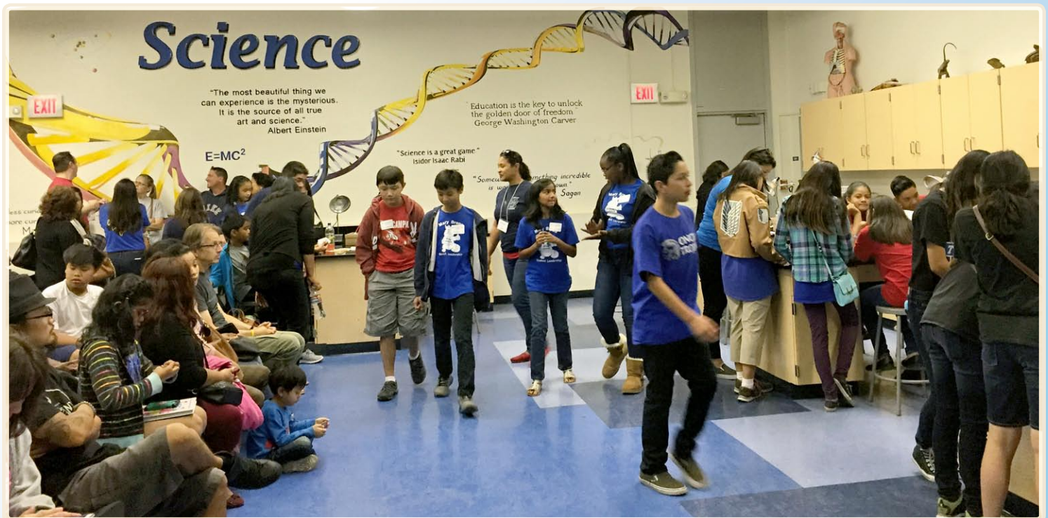
Elementary STEM Olympics at Tetzlaff MS