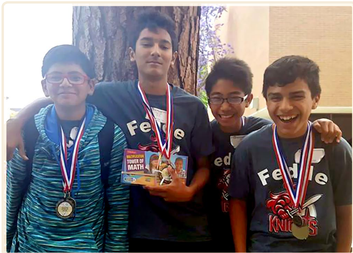
Fedde MS Bronze Medal Winners

ABC teams won three medals at the Los Angeles County Office of Education (LACOE) Math Field Day. Two Silvers medals were presented to Wittmann ES and one Bronze medal was presented to Fedde MS. This is a huge accomplishment for our ABC students as they competed against 33 school districts in LA County. The competitors almost filled the entire auditorium at Glendale H.S. It was a great experience for our students and the first time Wittmann ES participated in the event. ▶