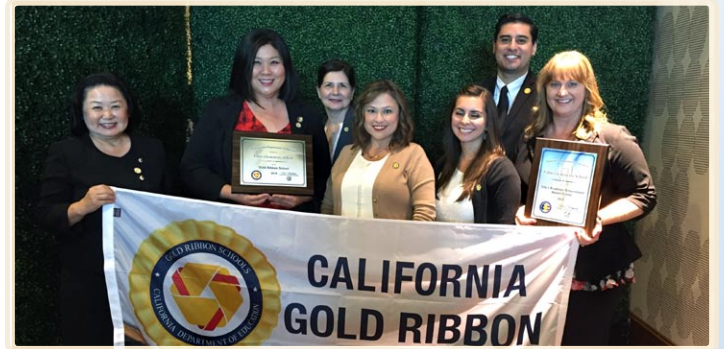
Palms ES is one of 9 Gold Ribbon Schools.